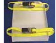
MT-12/24 Mounting Trays