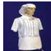
HCW Hooded COOL SHIRT