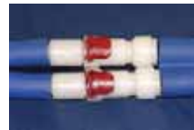
PRC Safety Pull Release